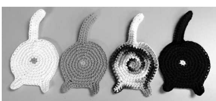
You can set down your drink on one of these cat-behind coasters if you finish in exactly second place in this week's contest.

Still running - deadline Monday night: Our contest for comical fundraising challenges a la the Ice Bucket. See bit.ly/ invite1092.